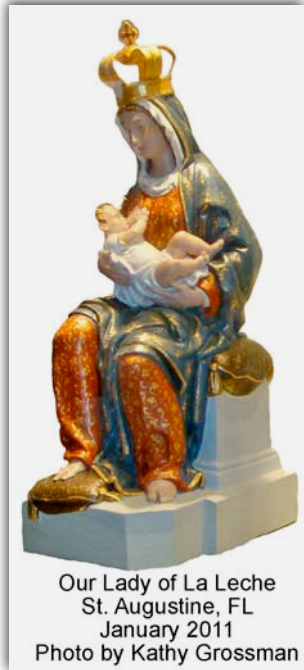
Our Lady of La Leche St. Augustine, FL January 2011

* Freely translated, "Our Lady of Happy Delivery and Plentiful Milk." (from The LLLove Story, 1977)