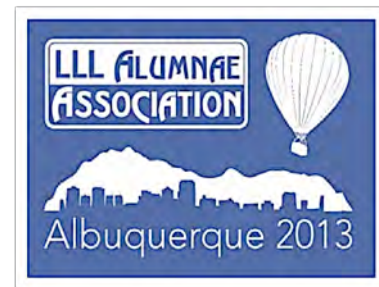
Albuquerque Trip Logo designed by Paul Torgus