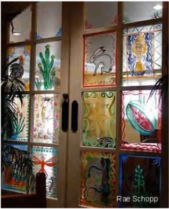
Door in Hotel Albuquerque